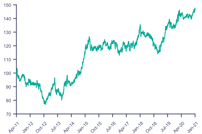
Past performance does not guarantee of future results. Performance is presented net of fees and expenses.